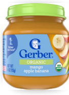
Mango Apple Banana Organic