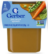
Pea Carrot Spinach