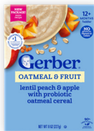
Lentil Peach & Apple Oatmeal Probiotic