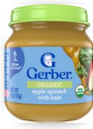
Apple Spinach with Kale Organic