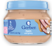
Ham and Gravy