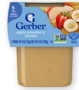
Apple Strawberry Banana