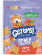
Get 'Ems Space Crackers, Maple