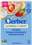
Lil' Bits® Banana Strawberry Oatmeal