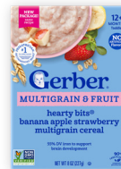
Hearty Bits® Multigrain Banana Apple Strawberry