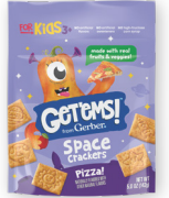
Get 'Ems Space Crackers, Pizza