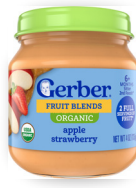
Apple Strawberry Organic