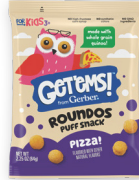
Get 'Ems Roundos, Pizza