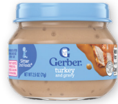
Turkey and Gravy