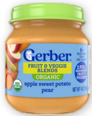
Apple Sweet Potato Pear Organic