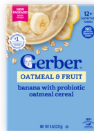
Banana Oatmeal Probiotic