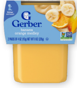
Banana Orange Medley