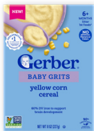
Baby Grits Yellow Corn