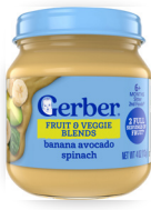
Banana Avocado Spinach