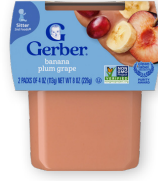
Banana Plum Grape