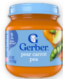
Pear Carrot Pea