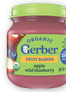
Apple Wild Blueberry Organic