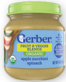
Apple Zucchini Spinach Organic