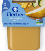
Pear Zucchini Corn