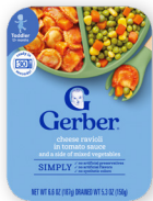
Cheese Ravioli in Tomato Sauce and a Side of Mixed Vegetables