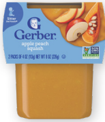
Apple Peach Squash