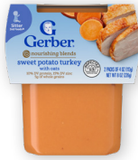
Sweet Potato Turkey with Oats