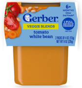
Tomato White Bean