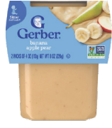
Banana Apple Pear