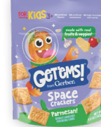
Get 'Ems Space Crackers, Parmesan