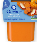
Sweet Potato Apple Pumpkin