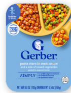
Pasta Stars in Meat Sauce and a Side of Mixed Vegetables