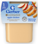
Apple & Chicken