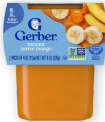
Banana Carrot Mango