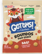
Get 'Ems Roundos, BBQ