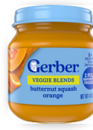
Butternut Squash Orange