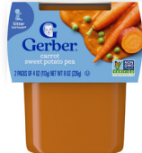
Carrot Sweet Potato Pea