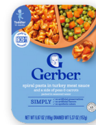
Spiral Pasta in Turkey Meat Sauce and a Side of Peas & Carrots