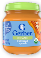
Butternut Squash Organic