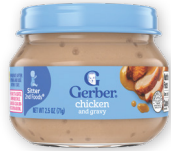
Chicken and Gravy