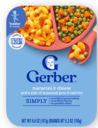
Macaroni & Cheese and a Side of Seasoned Peas & Carrots