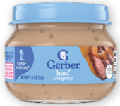
Beef and Gravy