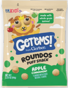
Get 'Ems Roundos, Apple Cinnamon